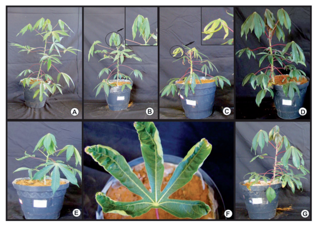
Figure 1. Control (A) and cassava plants treated with herbicides: fomesafen (B), nicosulfuron (C), fluazifop-p-butil (D), oxyfluorfen (E), metribuzin (F) and fluazifop + fomesafen mixture(G).

In the visual analysis of the plants under treatments injuries were observed, such as the curling of leaves, in plots treated with metribuzin (Figure 1-F), wilting and beginning of chlorosis in plots which received fomesafen and nicosulfuron (Figure 1-B, 1-C), respectively.