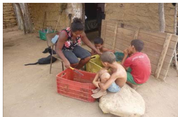
Figure 1. Extractive worker performing pequi rolling in Barreiro Novo camping site in 2016.

Rolling consists in separating the stones from the peels, and with the help of a knife, the peel is cut in two parts; care must be taken not to cut the stone, and then, when a light pressure is applied, the stone is detached (Figure 1). Oil can be extracted from the stone or the almond, i.e. the desired part is taken to a large pan and cooked for hours until it is possible to manually separate the oil from the residues.