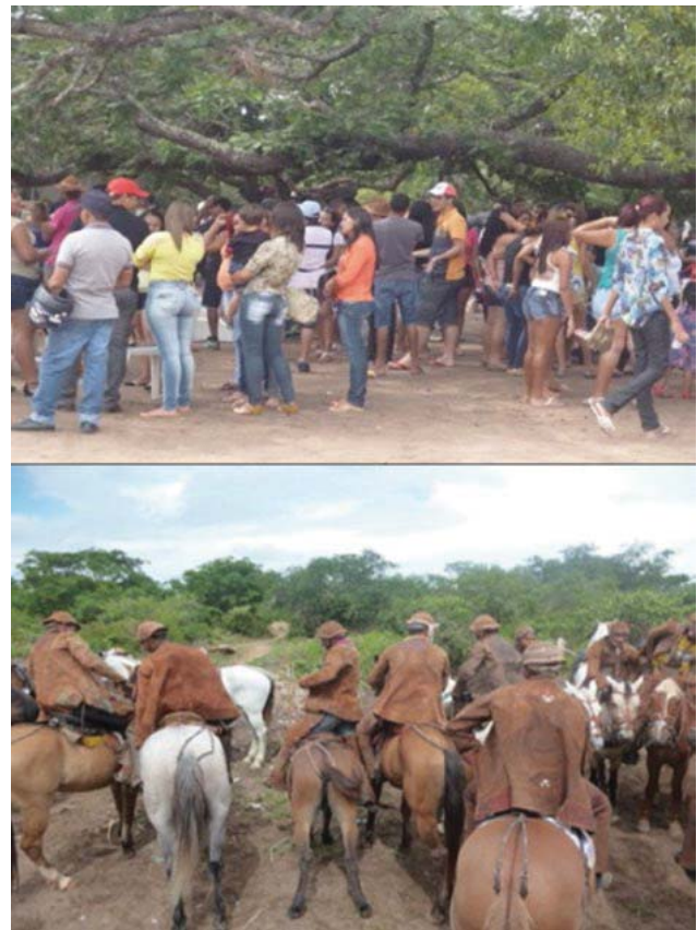
Figure 2. “Pequizeiros’ Ranch Party”, 23 of March 2016. (above) Pequizeiros and local people; (below): traditional cowboys.

In this aspect we can see the cultural dimension interlacing itself with the social dimension. However, in order to reach this integrated dimension, it is necessary to have policies that value, spread and ensure that everybody has access to what states to be traditional, both in the urban as well as in the rural environment. This reality was highlighted during the celebration, in which pequi collectors could be distinguished from neighboring city dwellers, as they gathered and exchanged experiences, celebrating one more year of collection. Moreover, this was a space for celebrating, giving thanks, reuniting with friends and family, and being cheerfully interlaced with the local culture. In Figure 2A and 2B we can see pictures of the traditional cowboys on their horses, the pequizeiros and many people having fun during the “Pequizeiros Ranch Party”.