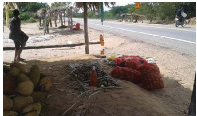
Figure 3. Selling pequi at Barreiro Novo camping site located on the state highway CE-060 in 2016.

In addition, all the pequi collected is sold at the camping site. The fruits are stacked very close to the CE 060 highway (Figure 3), so drivers that pass by can see the produce and if interested, they stop and buy the product. This is one of the reasons why the camping site is so attractive for the families, as it makes product selling easier.