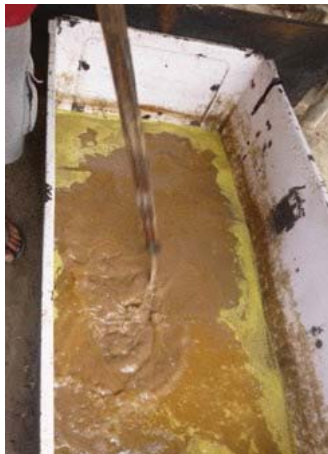
Figure 4. Pequi cooking for oil production, Barreiro Novo camping site in 2016.

When male interviewees were asked about what is more viable, i.e. selling pequi in natura or processed, they claimed that they preferred trading it in natura because processing is laborious and it also falls into the category of women responsibility. Oil extraction is a laborious activity because women mentioned that it is necessary to cook the fruit for one hour and then grate it. Once it has been grated, it has to be placed in water over the fire. After ca. fifty minutes the oil can be separated from the water with the help of a bowl; then the oil is bottled and can be sold. However, pequi extractors mentioned that the almond oil is purer as it is visually clearer and the almond needs to be removed from inside the fruit. Such activities demands care and experience because the fruit has thorns between the pulp and the almond (Figure 4).