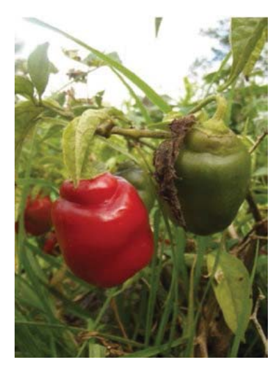
Figure 1. The intense red color in rocoto pepper fruits. Evidence of physiological maturation stage.

To guaranteed seed extraction, longitudinal cuts were made on fruits using surgical masks and latex gloves (Pacheco & Zuñiga, 2007). Seed disinfection was performed by seed washing with hypochlorite water solution at concentration of 5% v/v, followed by two washes with deionized water. Subsequently, seeds were dried at room temperature for one day.