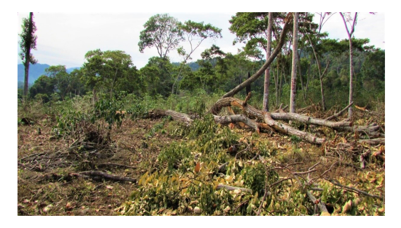
Figure 2. Abandoned coffee production field in the province of Chanchamayo, department of Junin.