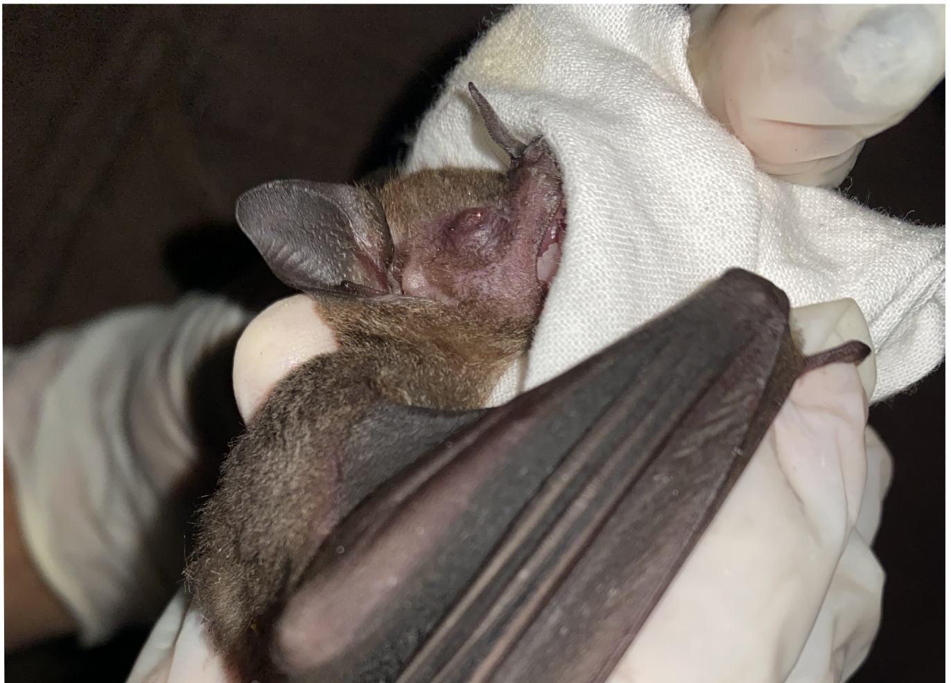
Figure 2. Individual of C. perspicillata captured in the Bunorgandi Private Nature Reserve with ocular anomaly in the right eyeball.

There are few records of ocular lesions, anomalies or diseases in bats, currently restricted to a few species in only five reports (Table 1).