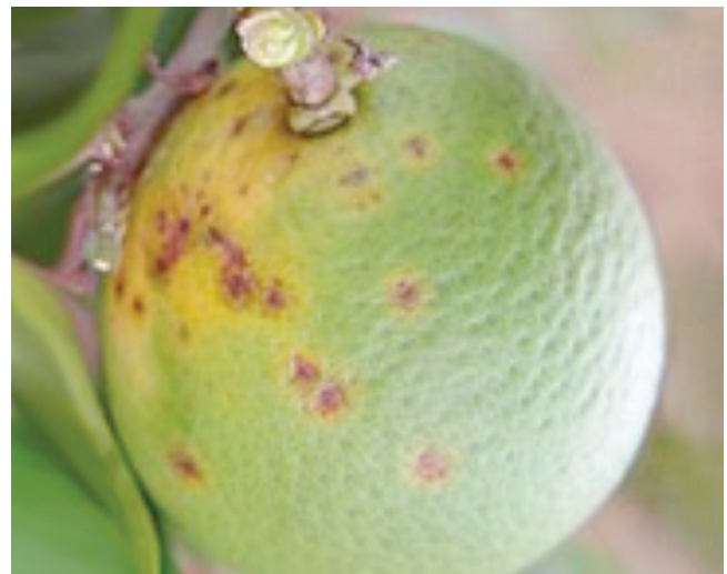
FIGURE 3. Symptoms of leprosis in 'Valencia' orange fruit. Meta, Colombia. Left: initial state. Right: advanced symptoms.