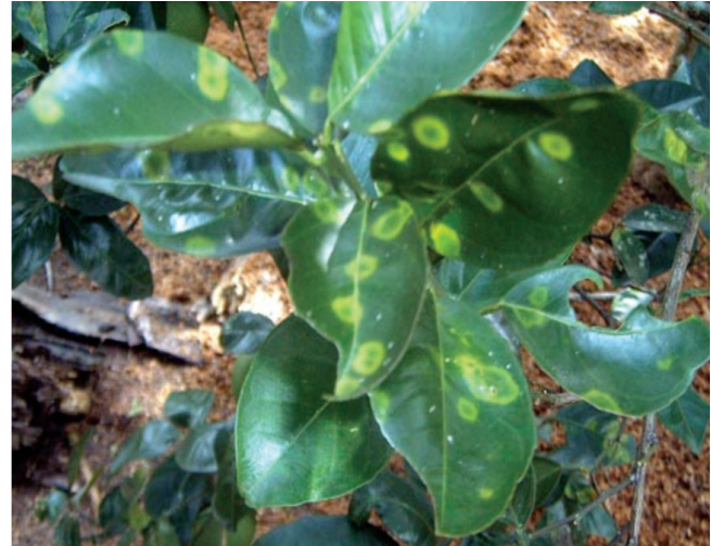
FIGURE 1. Typical initial leprosis symptoms in orange leaves. Meta and Casanare, Colombia.