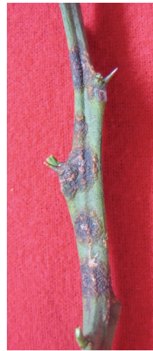
FIGURE 2. Symptoms of leprosis in Valencia orange branches. Meta and Casanare, Colombia. Left: initial state. Right: advanced.

means it does not spread through the plant (Kitajima et al. , 2003). When the inoculum and virus vector are present in the field and there is no control, the entire cultivation could be contaminated in two or three years Rodrigues et al. (2001). Therefore, most leprosis control studies are focused on vector management (Alves et al. , 2005). Lesions grow 5 to 7 mm in diameter every 15-20 d. When the severity is greater than 30%, affected leaf drop occurs on average 70 d after onset of the first lesion (León et al. 2006).