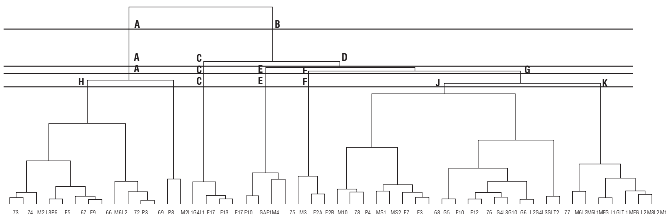
FIGURE 1. Grouping by similitude of the analyzed variables from the results and interpretation of the soil analysis. This dendrogram was built with the statistics program SPAD 3.5.

On the third division, five groups are observed A (23%), C (6%), E (6%), F (5%) and G (60%). Groups E, F and G are