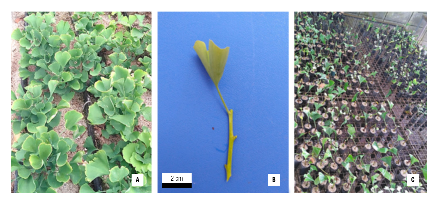
FIGURE 1. A) Mini-stumps, B) mini-cutting, and C) experiment installed in the greenhouse.

After preparation, mini-cutting bases were immersed in the indole butyric acid (IBA) plant growth regulator in