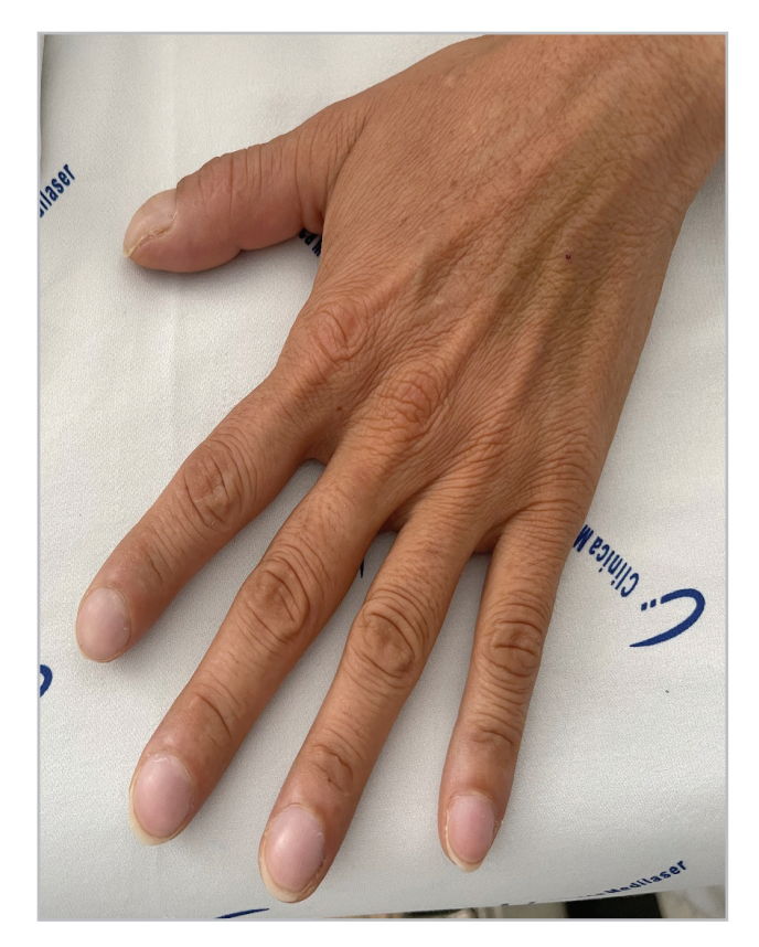
Figure 1. Signs of nail clubbing.