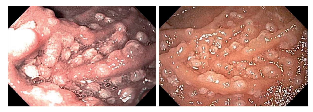
Figure 1. Nodular smooth mucosa on second portion of duodenum

Franco DL, Islam S, Ruff K Biomédica 2015;35:21-3