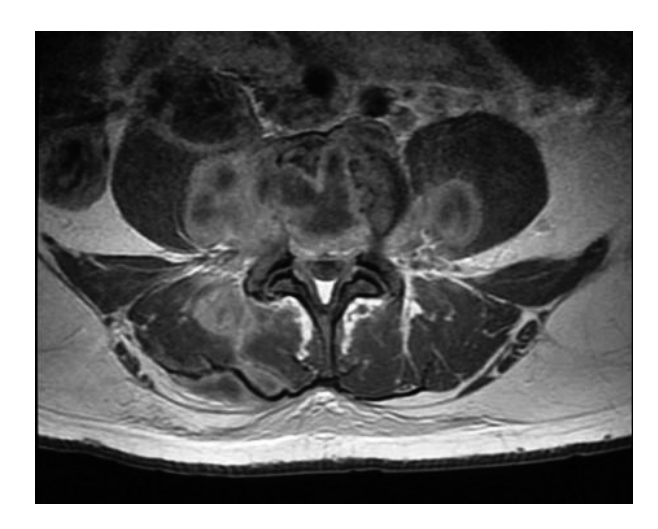
Figure 2. Axial non-fat suppressed T1-weighted image shows multiple abscesses affecting both psoas muscles and right posterior paravertebral muscles.