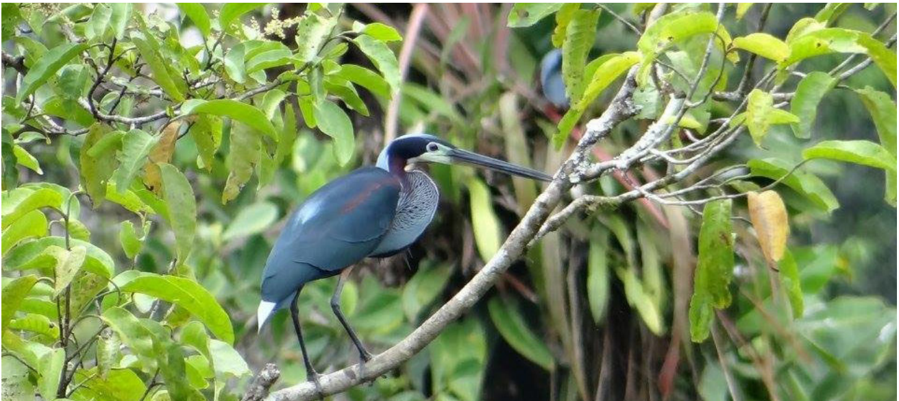
Figure 2. Agami Heron ( Agamia agami ), in Tambococha, Yasuní National Park, Ecuador.

The nesting colony of Agamia agami is found in Tambococha, Yasuní National Park (1°5'11"S, 75°33'42"W, 130 m). The nesting area is approximately 2 ha, and the nests are located together between 2 and 3 meters above water level (Figure 3).