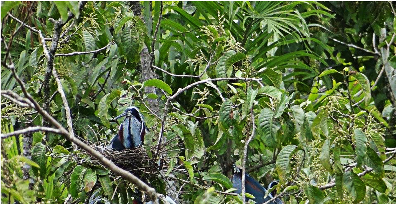
Figure 3. Nesting area of Agami Heron ( Agamia agami ) in the Amazon Rainforest, Tambococha, Yasuní National Park, Ecuador.

Seventy nests were recorded, with at least one adult sitting on each, as if they were incubating, and some other adults were observed carrying thin branches to build the nest. Up to March 2017, no eggs were seen in the nests.