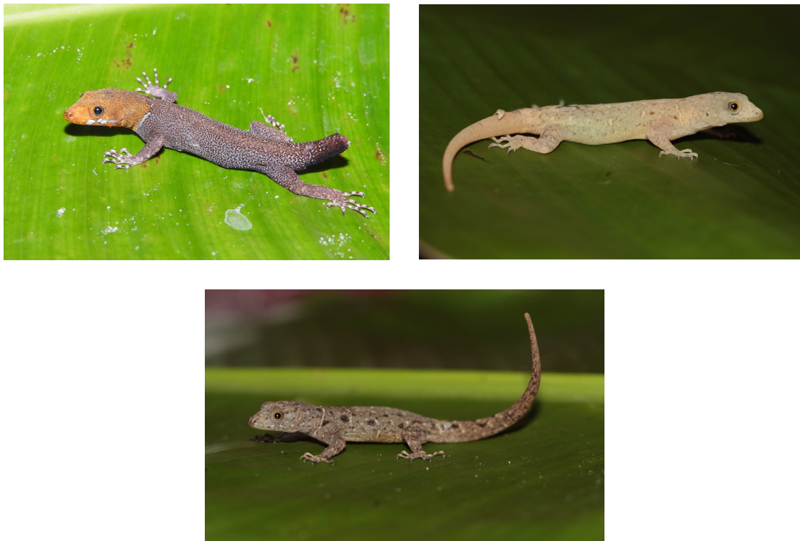
Figure 1. Gonatodes albogularis . A, male specimen (SINCHI-R-389); B, female specimen with leucism (SINCHI-R-538); C, female with normal coloration (SINCHI-R-541). The three specimens are from Inírida, eastern Colombia.