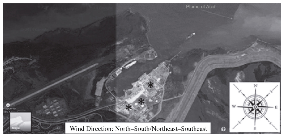
Figure 1. Aerial image of Puerto Moa / *Identified sources of contamination related to port activity.

Port infrastructure: This is assessed through a company's previously characterized general organization chart (tool), and the areas of impact for the study are identified and valued according to their operation.