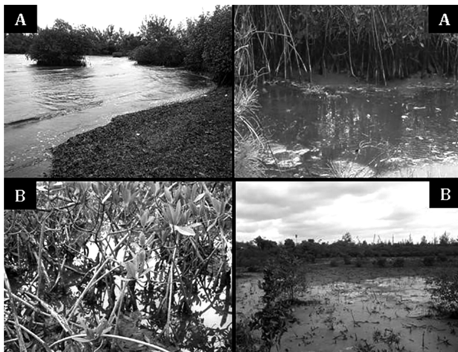
Figure 3. Images of areas affected by oil hydrocarbons from the companies established in the port. Mangrove (A). Marsh (B).

sults between 50 and 75 show five attributes affected corresponding to M114, M213, M214, M513 and M613, amounting to 21%.