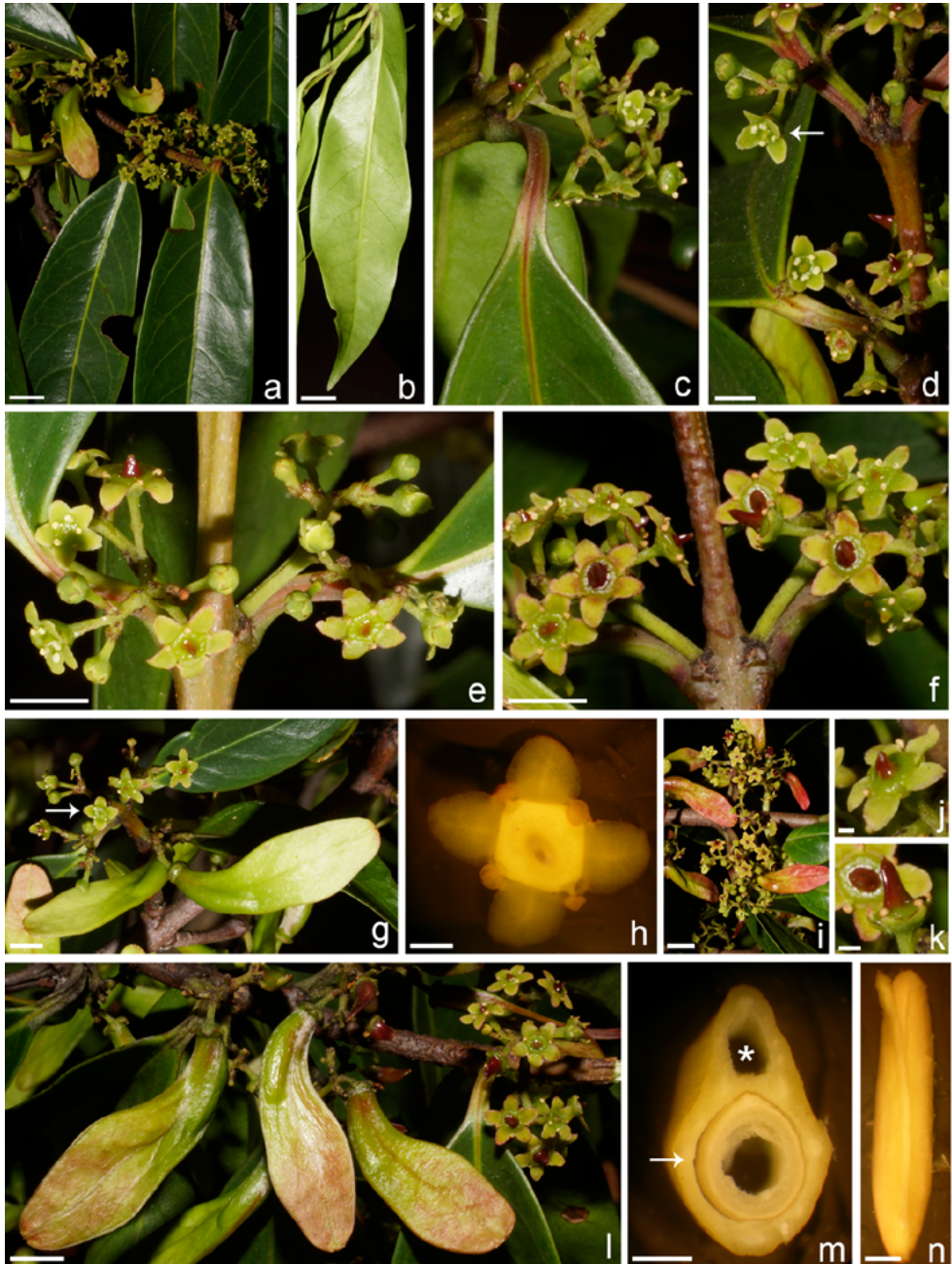
Figure 1. Zinowiewia sebastianii (González 4644). a. Apex of a flowering branchlet. b. detail of lower leaf surface. c. detail of petiole and dichasium. d-g. Fully developed dichasia; note tetramerous flowers (arrows) in d and g . h. Detail of a tetramerous flower. i-k. Late gynoecium elongation and samara formation. l. Samaras; note the 2-forked dichasia when fully developed and fruit set. m. Transverse section through the base of a samara showing the fertile, one-seeded locule (arrow) and the vestigial locule (asterisk). n. Seed. Scale bars: 5 mm in a, b, i, l ; 2 mm in c-g, l ; 500 µm in h, j, k, m, n .