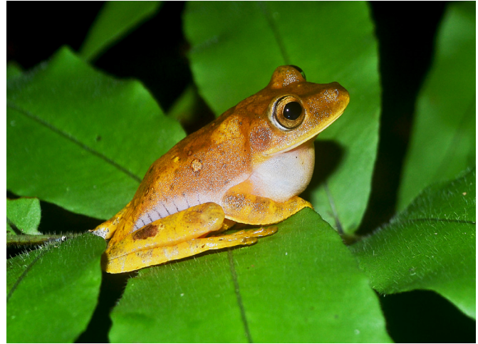
Figure 1. Specimen of Boana icamiaba collected at Parque Estadual do Cristalino, municipality of Novo Mundo, Mato Grosso state, Brazil.

The collected specimens of B. icamiaba are in total accordance with the original description of Peloso et al. (2018). The main characters that distinguish B. icamiaba from all species in the B. geographica-semilineata clade are: (1) presence of a prepollex developed into a spine, which is absent in the species of the B. geographica-semilineata clade; and (2) absence of nuptial pads, which is present in the species of the B. geographica-semilineata clade. Additional morphological and bioacoustic comparisons between B. icamiaba and named species of the B. semilineata group are presented in Peloso et al. (2018). In addition to the specimens found at sites in Mato Grosso state, we also found new records of B. icamiaba for the state of Rondônia based on the two specimens collected in the municipality of Parecis (12°14' South, 61°11' West). The vou-