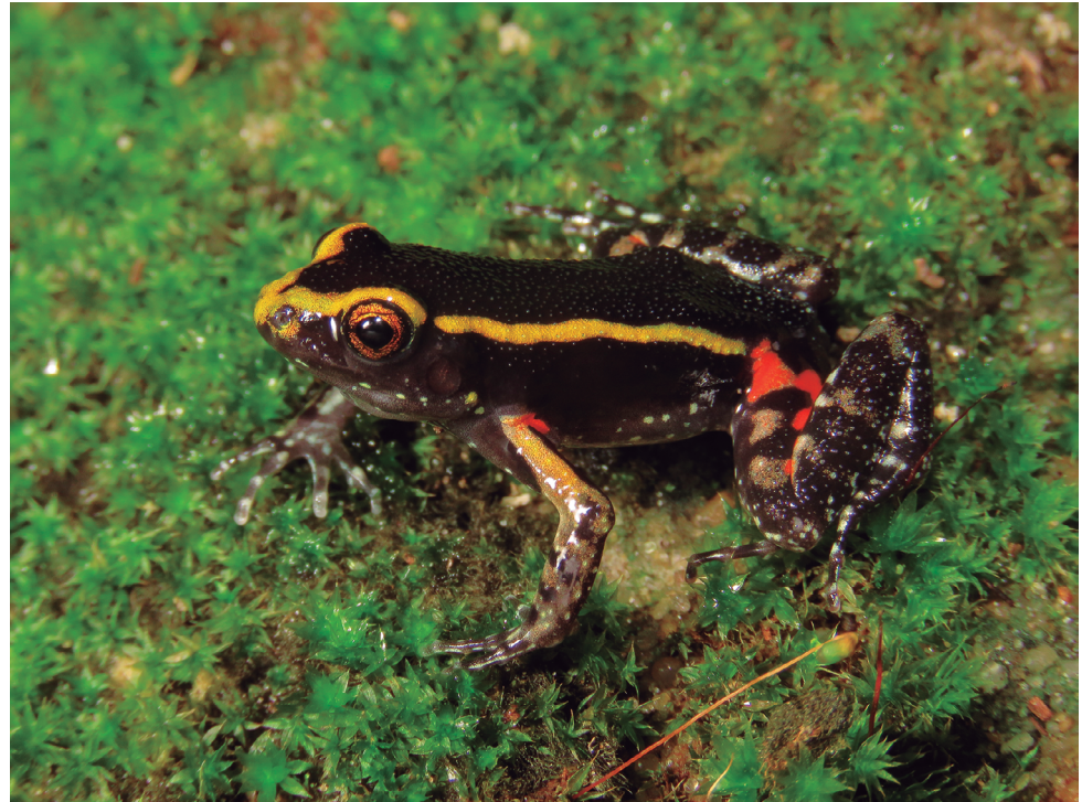
Figure 2. Individual of Lithodytes lineatus (ZUFMS-AMP: 08394) from Caseara municipality, Tocantins state, Brazil.

(9°24'25.36" South; 49°58'21.33" West). The records of L. lineatus to the Caseara municipality extend its distribution in approximately 280 km south-west from the previously southernmost locality in the state, reported from Palmeirantes municipality (Pavan 2007) (Fig. 1).