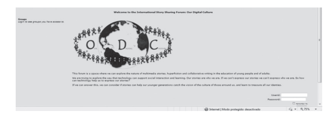
Figure 1. Virtual Forum Home Page

online environment for students and teachers to interact and to learn about other cultures and languages. The virtual space hosted schools and universities from Colombia, Chile, Canada, and Scotland. The following image shows the main page of the platform: