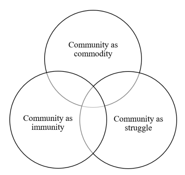
Figure 1. Alternative theoretical framework

When my mother left her hometown And inspired the rest of her family Everyone moved to Bogotá as well.