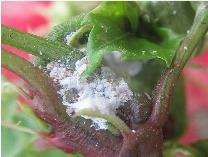
Figure 1. An aggregation of Maconellicoccus hirsutus (Green) on leaf axils of Hibiscus rosa-sinensis , San Andres Island, Colombia.

Despite the vicinity of San Andres to Central America, the PHM was likely introduced to San Andres from mainland Colombia on ornamental plants because of the constant trade between the island and mainland Colombia (Kondo et al. , 2012). High populations of the PHM can result in prolific production of honeydew, subsequently causing sooty mold growth, and heavy populations may cause host-plant wilting; the mealybug injects a toxic saliva during feeding, which can cause a characteristic symptom known as bunched top in hibiscus (Hodges and Hodges, 2006).