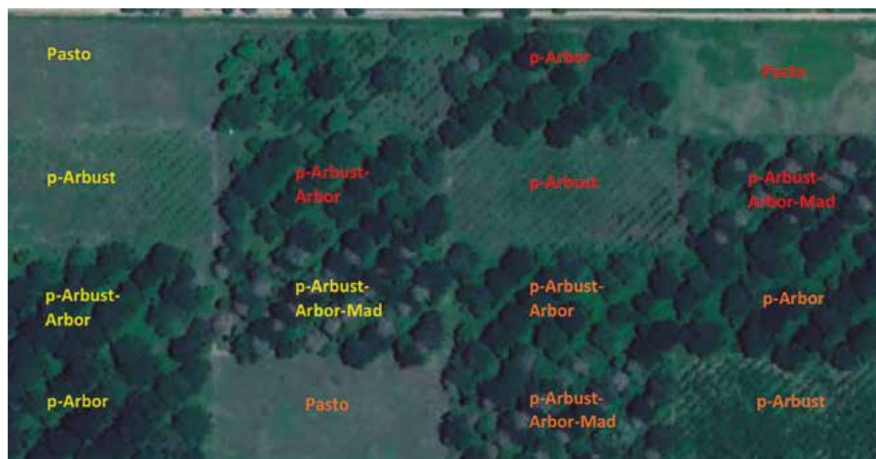
Figure 1. Satellite image of the spatial distribution of the silvopastoral systems assessed in CI Turipaná (AGROSAVIA), Cereté (Córdoba, Colombia). Block 1: orange; block 2: red, and block 3: yellow.

The experiment was carried out in an area of 30 ha divided by a differential drainage effect in three sectors characterized as blocks (poor, moderate and optimal drainage). In each block, a replicate of the evaluated treatments was established in an area of 2 ha (100 m wide by 200 m long), for a total of three replicates per treatment and 15 plots (figure 1). Each treatment was divided into five strips of 4,000 m 2 subject to a grazing scheme of 2 days of occupation and 28 days of rest.