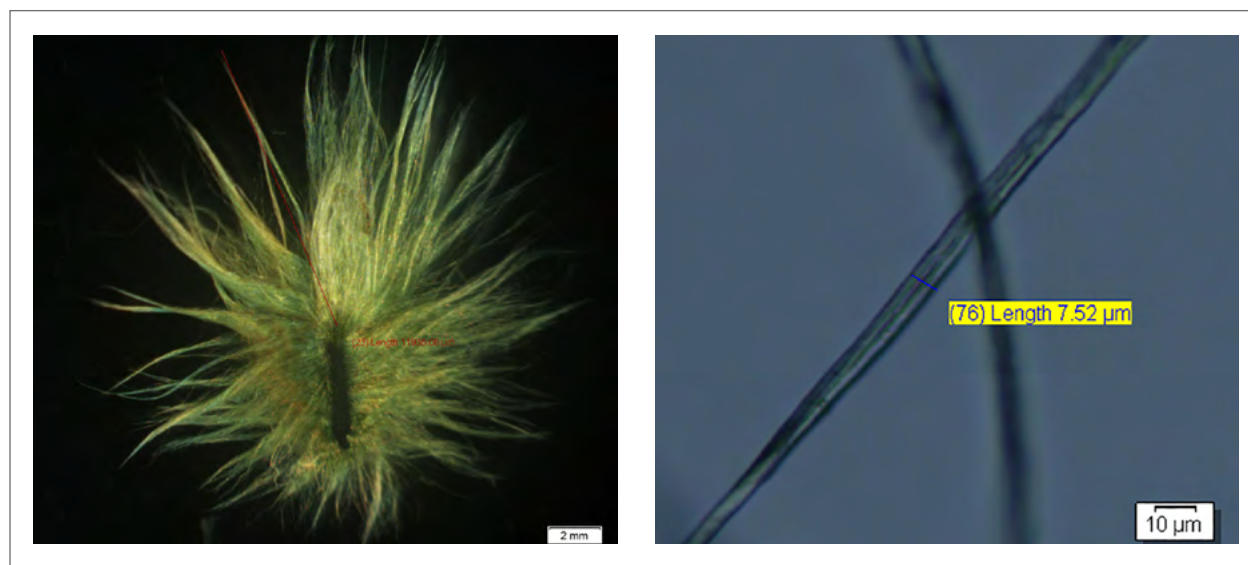
Figure 2. Length and width measurement of the fiber of the wild cotton ecotype ( G. raimondii ).