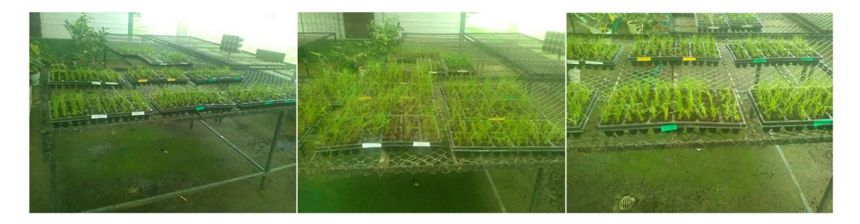
Figure 5. Ex vitro adaptation of arrow cane (G. sagittatum) cv. Criolla, Criolla 1, and Martinera micropropagated plants.

In vitro rooted plants from all cultivars and micropropagated shoots from the multiplication stage showed complete (100%) survival and full adaptation when transferred to ex vitro conditions (figure 5). Four weeks after transferring, plants were healthy, green-colored, and actively growing with no dead tissues, necrotic areas, or adventitious growth (figure 5).