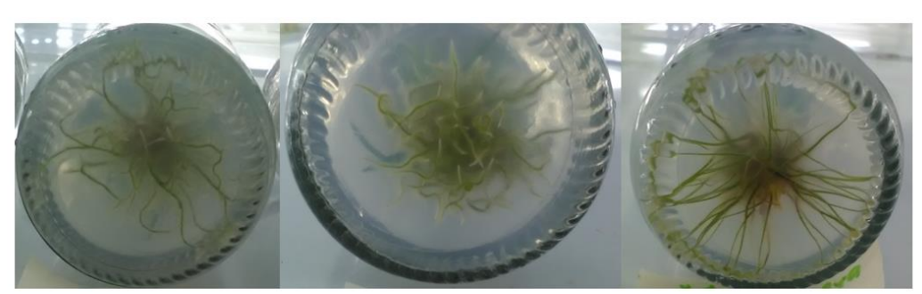
Figure 4. Rooting of in vitro grown arrow cane ( G. sagittatum ) cv. Criolla (left), Criolla 1 (center), and Martinera (right) shoots after four-week culturing in an MS medium supplied with 1.0 mg/L NAA.

The length adventitious roots were statistically affected by the NAA supply in the medium (Pr < 0.05). The Tukey's test showed that the longest roots for Criolla 1 (6 cm), Martinera (3.8 cm), and Criolla (3.66 cm) occurred in shoots cultured in a medium without the NAA supply; in contrast, roots always shortened when explants were cultured in an NAA supplied media. Roots cultured in NAA were proportionally shortened with increased NAA concentration (figure 4, table 3).