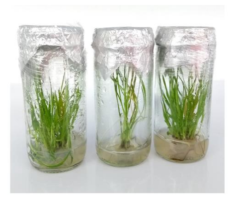
Figure 3. Arrow cane (G. sagittatum) shoot multiplication from explant with pre-existing meristems of Criolla (left), Criolla 1 (center), and Martinera (right) after four-week culturing in a double phase MS medium supplied with 0.5 mg/L BAP.

For shoot length, ANOVA allowed detecting statistical differences (Pr < 0.05) among all treatments. The longest shoots (10.8 cm) grew from Criolla shoots cultured with 0.5 mg/L BAP; however, it was not statistically different from Criolla 1 and Martinera shoots cultured at the same BAP level. Collected data showed a positive correlation (r = 0.78) between shoot length and BAP level in the medium (figure 3, table 2).