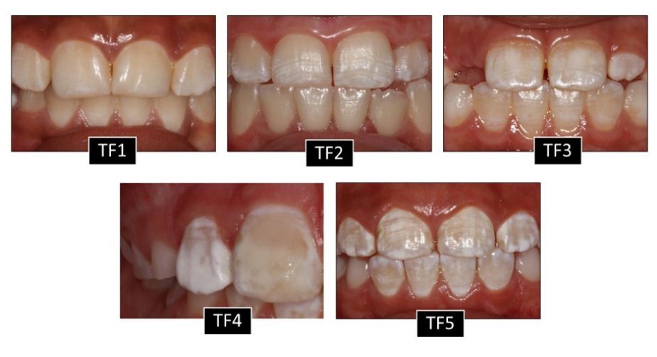
Figure 1. TF1: 12, 11, 21 and 22 teeth with fine white lines crossing the tooth surface. TF2: 12, 11, 21 and 22 teeth with more pronounced white and opaque lines that often fuse to form wider bands. TF3: 11 and 21 teeth with all dental surfaces show opaque white and cloudy areas. TF4: 12 teeth with every surface exhibit marked opacity. TF5: 12, 11 and 22 teeth with all surfaces opaque and depressions less than 2mm in diameter.

In all, 171 students, 8 to 12 years old, were included in this study; 55.6% were female. The prevalence of DF in this sample was 84.8% (n=145), with a higher prevalence found in males. DF severity ranged between TF1 and TF5 (Figure 1). Of the 2091 affected teeth, 38.6% (807) presented the score of TF1, 36.8% (770) had a score of TF2, 21.1% (444) were TF3, 0.5% (22) were TF4, and 2.8% (58) were TF5 (Figure 2).