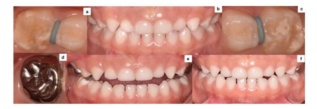
Figure 3. DMH severe clinical examination - Hall technical steel crown installation modified and 6-month follow-up. 3a. Tooth 55 presents fractured restoration, brown opacity, and structural loss on the palatal surface; elastic between teeth 55 and 54. 3b Initial occlusion. 3c. Tooth 65 with fractured and dislodged restorative material on occlusal and palatal surfaces. Elastic between teeth 64 and 65. 3d . Stainless steel crown on tooth 55 immediately after cementation. 3e. Occlusion after cementation. 3f. Occlusion at six-month follow-up.

Figure 2. Severe MIH clinical examination - modified Hall technical steel crown installation and two-year follow-up. 2a. Tooth 11 exhibits a cream, yellow and brown opacity with structural tooth loss; Tooth 21 presents well demarcated white opacity. 2b. Modified Hall Technique on 26; adaptation of elastic between tooth 65 and 26; 2c. Stainless Steel Crown cemented on 26. 2d. Occlusion after cementation. 2e-2f. Two-year follow-up of Severe MIH case. 2e. Crown on tooth 26 is well adapted and periodontal and dental integrity are evident. 2f. Permanent dentition with stable occlusion.