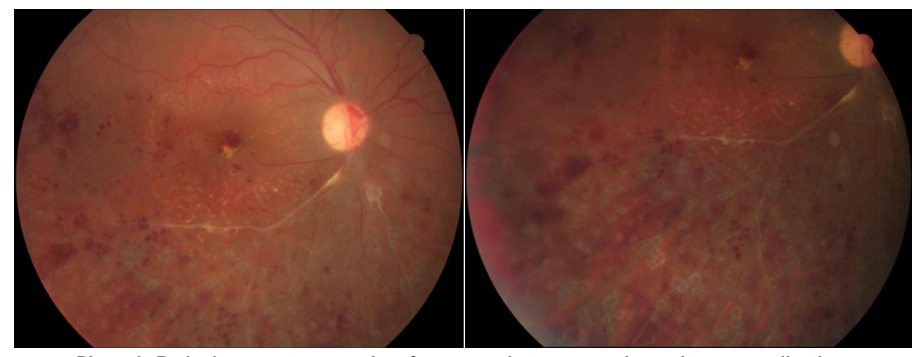
Photo 3. Retinal aspect two months after systemic treatment, intra-vitreous application of triamcinolone and retinal laser

ARN are, diffuse retinal arteritis, retinal detachment and arterial occlusion. From literature it is also known a multi focused dotted pattern with a very bad prognosis<sup>5</sup>.