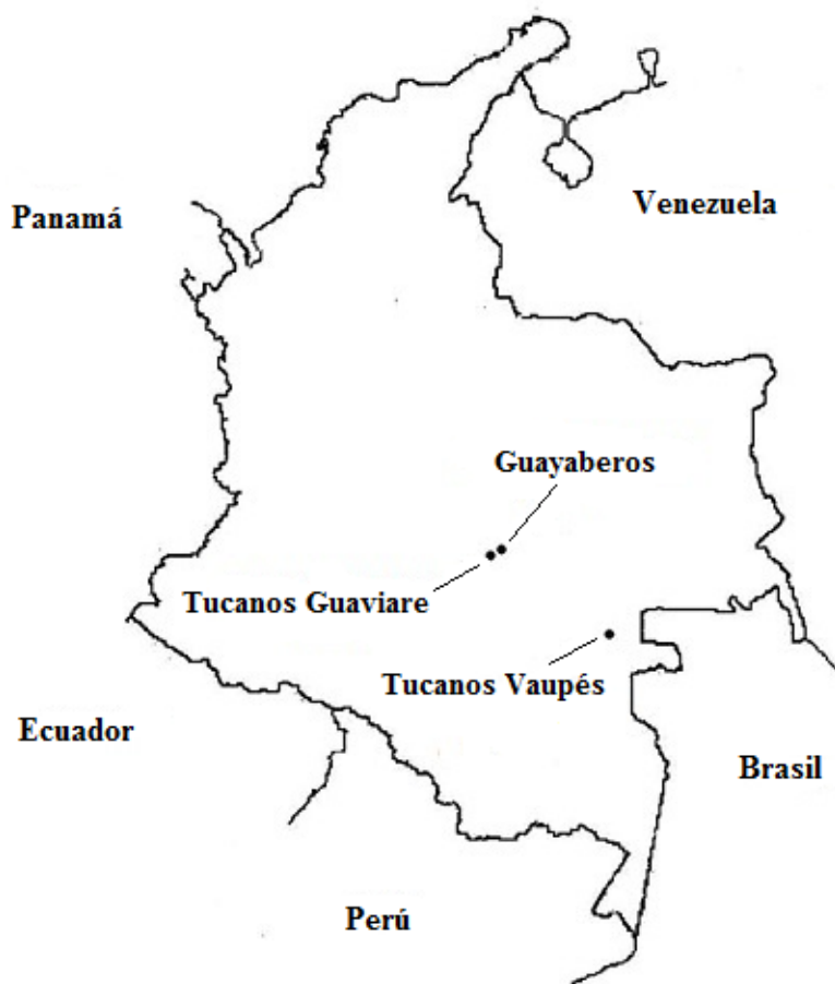
Figure 1. Map of continental Colombia with the location of the sampling sites: Mitú (Tucanos from Vaupés), El Refugio (Tucanos from Guaviare), and el Barrancón (Guayaberos from Guaviare)

net is reflected in the results presented here. On the other hand, geographical proximity is not synonymous of a common biological history. The Guaviare Eastern Tukanoans are located near the Guayaberos (~ 7 km) ever since approximately five decades ago.