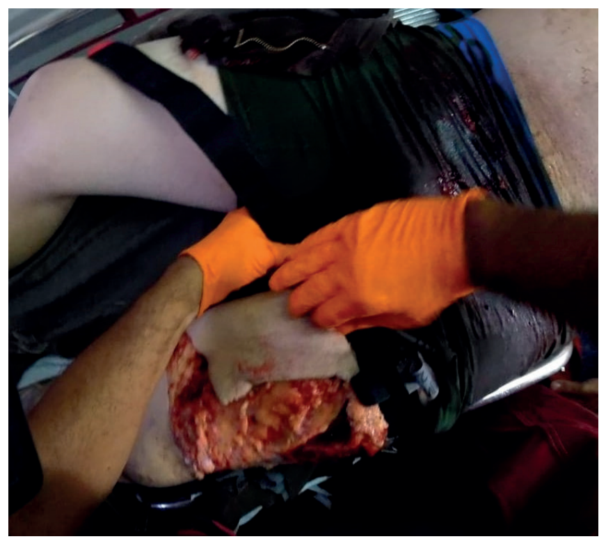
Figure 1. Combat Application Tourniquets being placed on a patient with extremity trauma at the scene.

The Trauma and Emergency Surgery group in Cali (CTE), has been pioneer on the education of both medical and non-medical personnel through the "Stop the Bleed" course throughout Latin America, specifically in Colombia, Costa Rica, and Ecuador. In our first course, with the training of 265 people, we compared if there were any differences if the courses were dictated by surgeons or by medical students. Among personnel with prehospital training prior to the course only 84.2% reported knowing how to apply any bleeding control technique, and only 43.4% stated that they would place a tourniquet in case of bleeding, however, this perception changed after