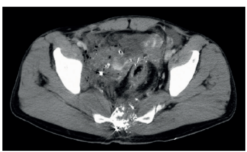
Figure 2. Computed Axial Tomography of the Upper Pelvis. Sacral fracture with several bone fragments, thickening of the rectal wall, para-rectal air and free intraperitoneal fluid are shown, in a patient with intraperitoneal rectal injury secondary to a high-speed gunshot wound in the upper quadrant of the left gluteus.