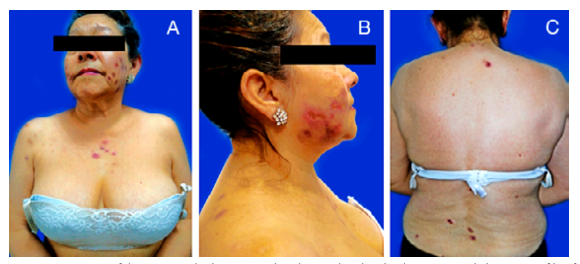
Figure 1. A. Front of the patient. The lesions can be observed in the cheeks, arms, and chest. B. Profile of the patient portraying a close up of the cheek lesions. C. Back of the patient showing the extent of the lesions.

perception of macroscopic parasites that crawl over her body, biting her face, head and anterior thorax, and leaving white eggs which evolve to brown adults in about eight days. She also referred generalized pruritus and shows excoriations due to scratching (Figures 1 and 2), which she "treated" with Vicks Vaporub, domeboro (calcium acetate and aluminum sulphate), crotamiton and Canesten (clotrimazole) cream. At some point, she also used thinner and varsol to wash her clothes and skin.