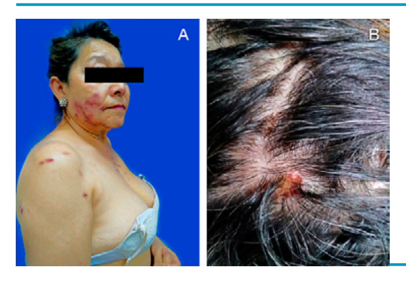
Figure 2. A. Profile of the patient showing the lesions on both cheeks B. Picture showing some of the multiple lesions on the scalp. Source: Own elaboration based on the data obtained in the study.

Figure 1. A. Front of the patient. The lesions can be observed in the cheeks, arms, and chest. B. Profile of the patient portraying a close up of the cheek lesions. C. Back of the patient showing the extent of the lesions. Source: Own elaboration based on the data obtained in the study.