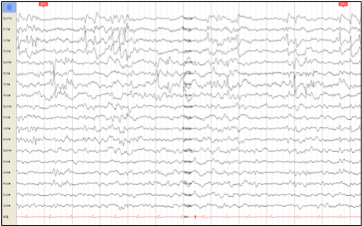
Figure 2. Electroencephalogram that reflects temporary, bilateral and independent epileptiform activity in the interictal sleep records. November 2015.