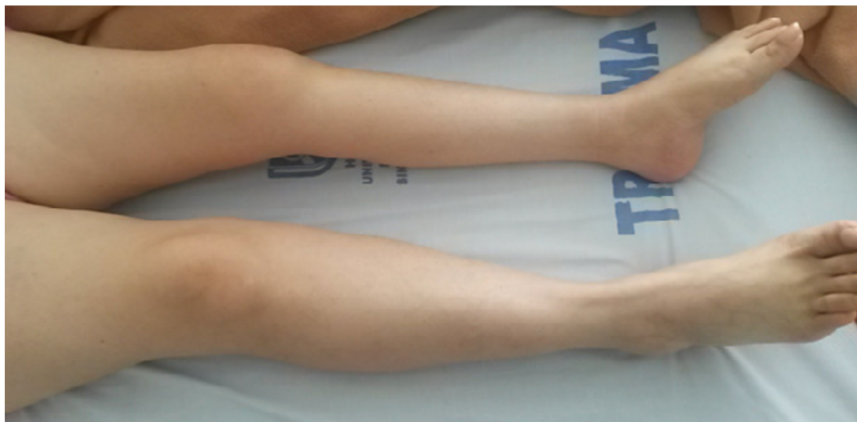
Figure 1. Significant atrophy of the left lower limb.

reflexes. On admission to the emergency service, a foreign body sensation was reported in the right dorsal region, possibly associated with the history of arthrodesis.