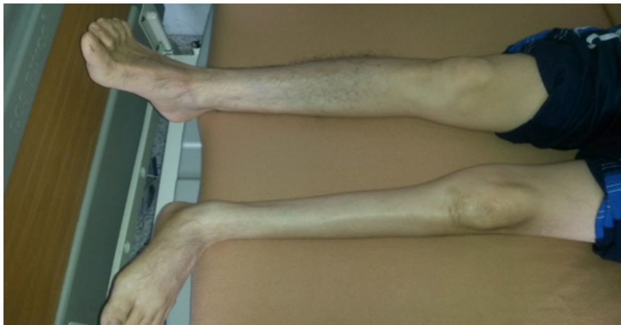
Figure 3. Significant atrophy of the left lower limb.

In addition to the initial symptoms, the patient reported fatigue when walking and myalgias with weakness in the left lower limb. Upon exploration of lower limbs, evidence of negative Patrick's test, intense muscular atrophy in the gastrocnemius and tibialis anterior muscles (with normal knee joint balance), lower extremity strength of 4/5, positive reflexes and preserved sensitivity were observed (Figure 3). Clinically, possible hip and sacroiliac joint pathology was ruled out. Although EMG was not performed, clinical differential diagnoses, such as a lumbar hernia, were ruled out through spinal magnetic resonance, which in turn ruled out nerve root compression.