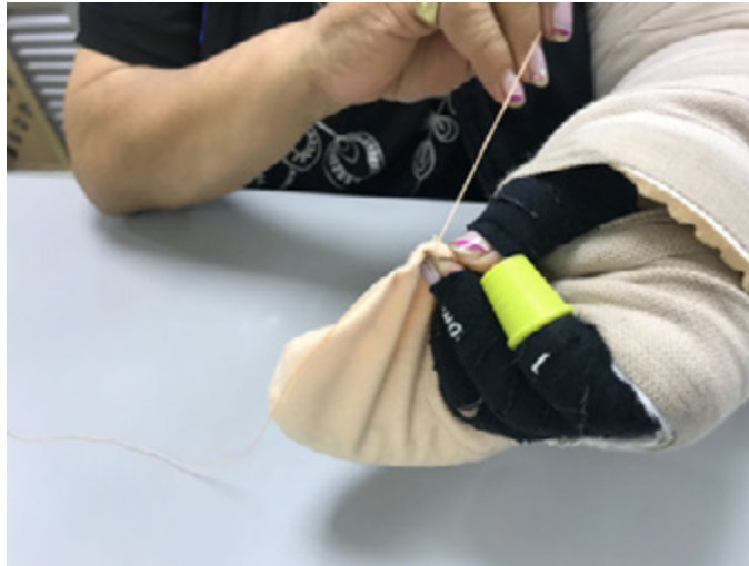
Figure 4. Manual task.

carried out in shorter times and the elements were distributed in a work plane as required by the person herself for better performance. As these tasks were related to her likes and interests, manipulation, coordination and efficiency were evident in each sensorimotor process performed.