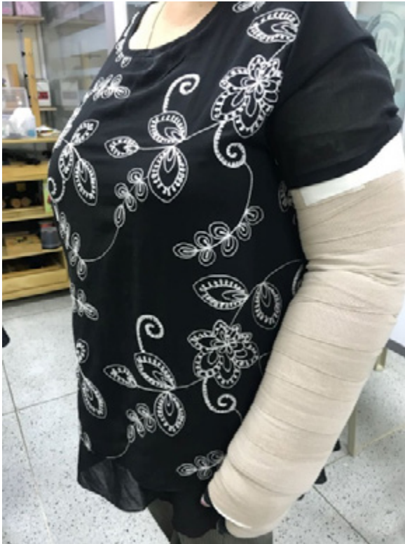
Figure 1. Final result and person