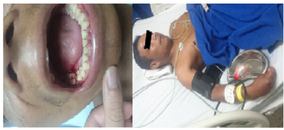
Figure 3. Bleeding of the gums.

Finally, two episodes of hematemesis occurred during hospitalization, for which hematology tests and blood chemistry were requested. Table 2 presents the results of the laboratory tests carried out on admission, revealing an increase in kidney function and alteration of liver function; deterioration of leukocyte and platelet function is also evident.