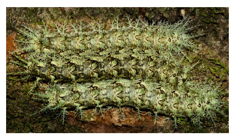
Figure 1. Lonomia obliqua larva.

The caterpillars of the Saturniidae species (Figure 1) are characterized by pointed and branched spicules, bristles or hairs that contain a complex mixture of enzymes and toxins. (3) These substances are released into the skin after contact, causing activation of the kinin-kallikrein system and fibrinogen-lytic enzymes that produce a wide arrange of signs and symptoms because of the alteration in the coagulation cascade involving factors VIII-XIII-X. (3,4) Authors have reported cases of caterpillar poisoning that start with multiple symptoms at the inoculation site and then progress to general symptoms. Initial symptoms include general malaise, headache and nausea, followed by hemorrhagic syndrome, which leads to multiple organ failure and even death. (5)