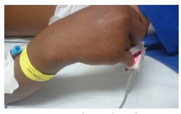
Figure 2. Primary site of contact with caterpillar Lonomia sp.

the elbow, sensation of paresthesia, pruritus, edema, redness and heat on the lesion site. He said that he applied a topical fungal cream 20 minutes after contact, improving the symptoms, pain and redness; however, edema of the hand persisted (Figure 2).