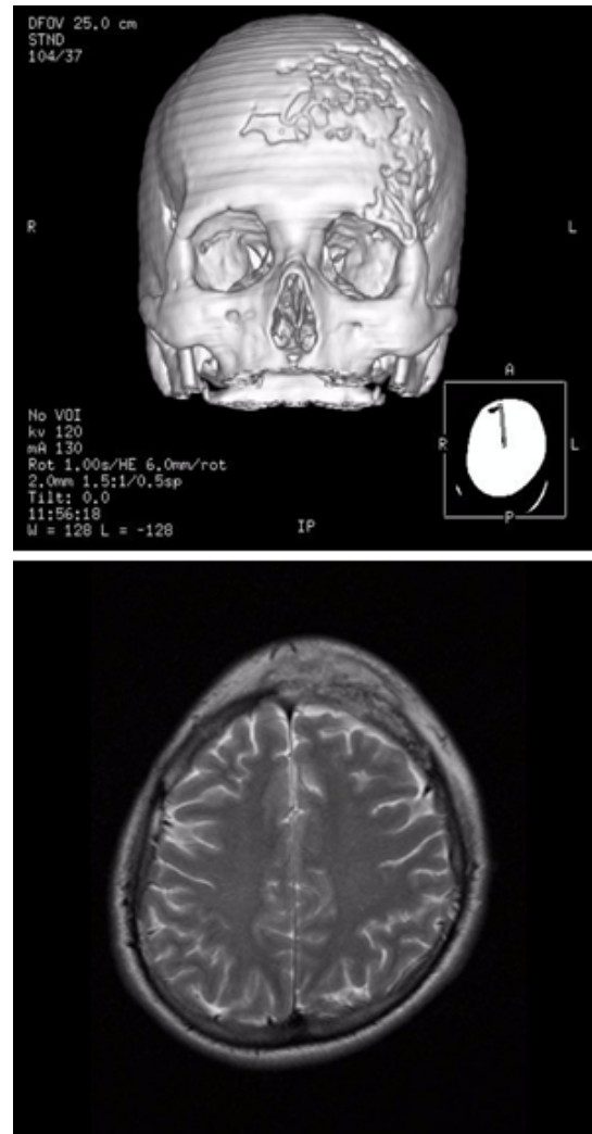
Figure 1. Initial imaging studies of the lesion showing extensive inflammatory bone involvement, with osteomyelitis as the first diagnostic possibility.

On physical examination, he presented with growth of the right frontal region, without the presence of dermatological lesions, lymphadenopathy or visceromegaly. Complementary laboratory tests (complete blood count, blood chemistry, sedimentation rate, C-reactive protein, proteinogram, immunoglobulins, complement, ANA, VDRL, hepatitis and HIV, beta-2-microglobulin and chest radiography) were performed, which were normal or negative. Initial imaging studies showed extensive inflammatory/infectious bone involvement, which led to suspect osteomyelitis as the first diagnostic possibility (Figure 1).