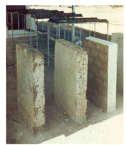
Figure 14: Different kinds of coating