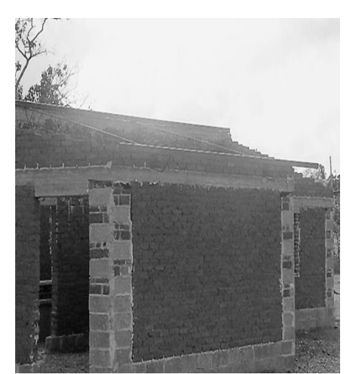
Figure 10: Only wall plural o singular supporting the collar beam