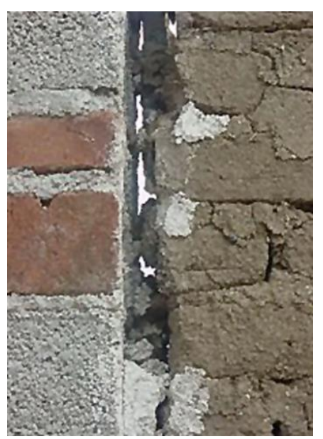
Figure 9: Only pillars supporting the collar beam

In the last case, when the collar beam is supported only by the wall, crack appearing is not probable because the settlement of the wall is uniform. To reach this kind of solution, the pillars must be almost 6 to 10 cm shorter than the wall. Fig. 10 and 11 show this situation.