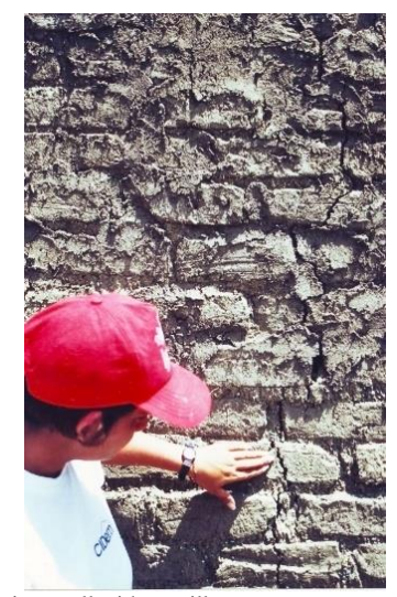
Figure 4: Cracks into wall without pillar

In walls longer than 5 m, with no intermediate pillars, a serious horizontal bending could happen and a vertical crack near the middle of the length may appear. It is caused by a drying stress higher than that allowable for this material (see Fig. 4).