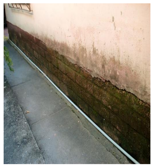
Figure 2: Fired bricks foot cord

Foot beams made of hollow cement blocks is a more efficient protection against all kind of humidity, even against capillary effects as Fig. 3 shows.