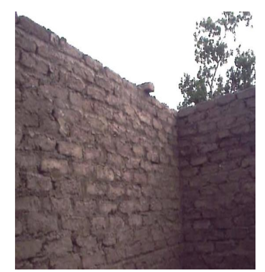
Figure 6: Binding mortar for adobe walls plural o singular

Tested mortar for Walls built mixing adobe with other material . We have also used combination number 3 of Table 2 for this purpose. Fig. 7 shows an adobe wall with some components of fired bricks, and mortar number 3.