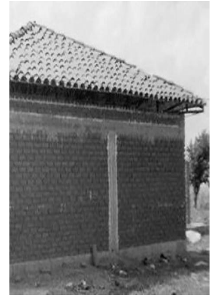
Figure 5: Wall with an intermediate pillar

To avoid this pathology, we could obey the recommendation of Habiterra Network [2], of keeping the length of the wall less than 2.5 times its total height, for walls without pillars. Our experience during this case study, following this recommendation, has provided the best results, as shown in Fig. 5.