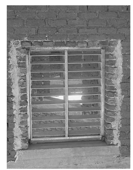
Figure 7: Adobe wall, mortar number three and fired bricks