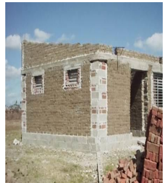
Figure 3: Hollow blocks foot cords