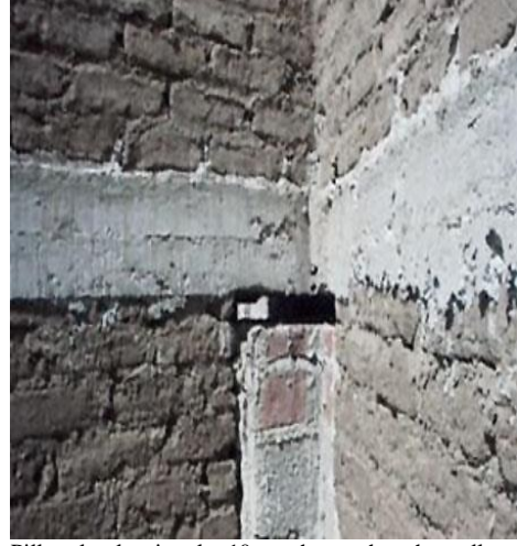
Figure 11: Pillar plural o singular 10 cm shorter than the wall

As long as the wall is receiving an important amount of load, its resistance against pulling or pushing is good enough for common situations.