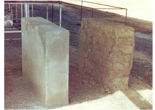
Figure 15: Difference between coated and uncoated walls