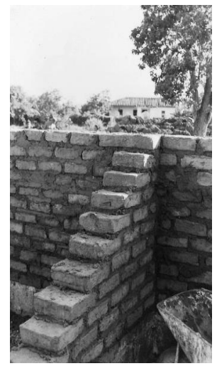
Figure 13: Solution for the lower lintel