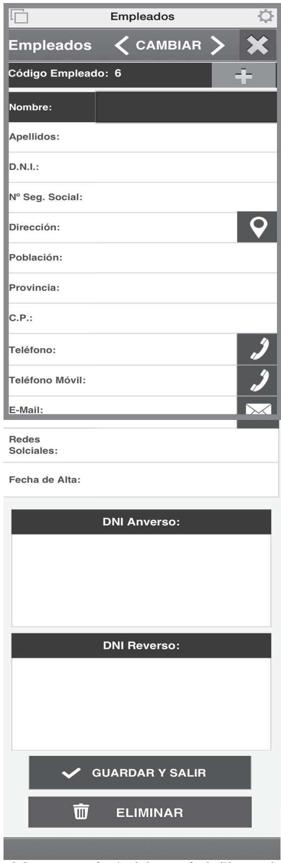
Figure 2. Screen capture of app's whole screen for the iPhone version. The scroll needed to finish this task can be seen here.