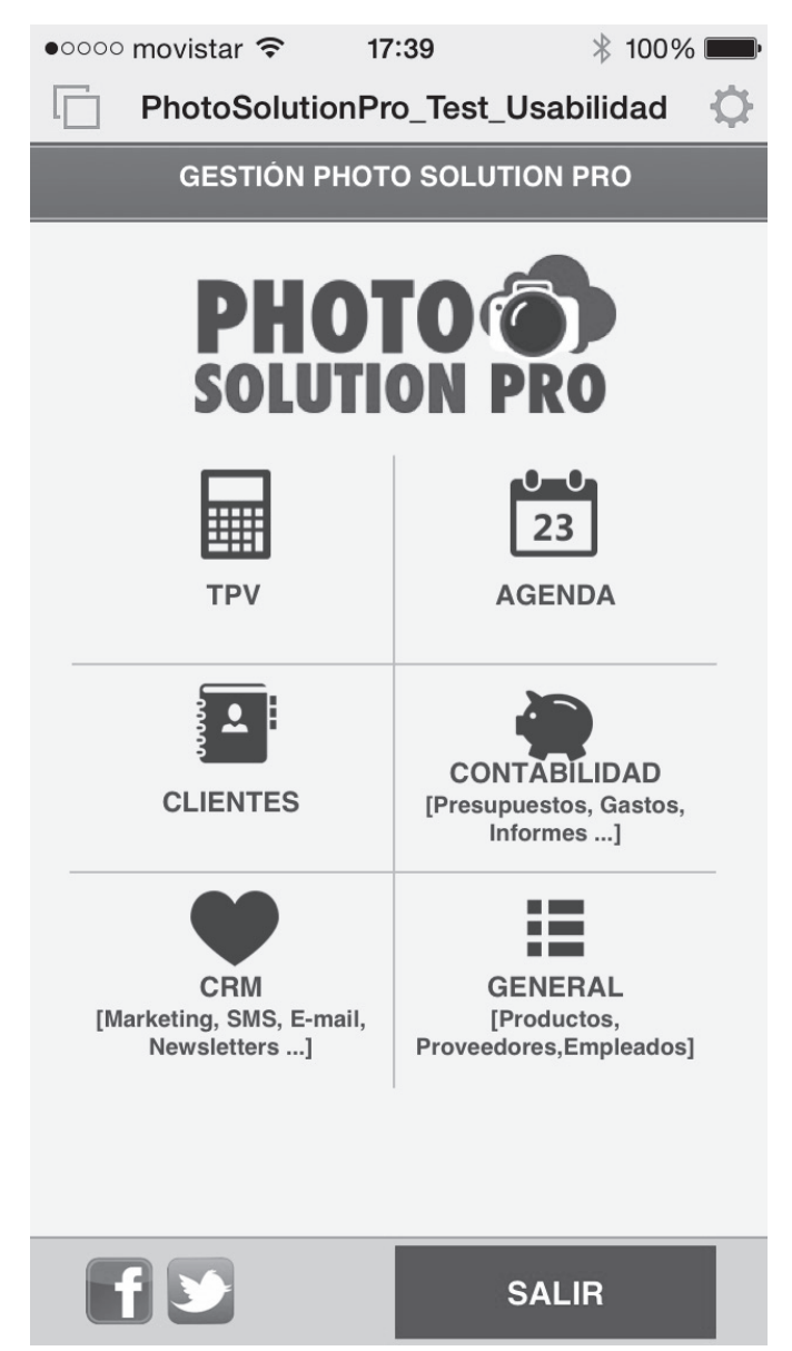
Figure 1. The app's main screen to be tested in this experiment (screen capture of the smartphone version: POS, events, customers, accounting, CRM, general preferences).

PhotoSolutionPro is an application that allows the entire workflow to be managed: from appointments, budgets, meetings, models, invoicing, expenses, marketing, profits and cash reports. In Fig. 1 we can see this application's main screen.