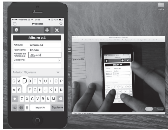
Figure 4. Registering a participant with the document camera and screen capturer of an iPhone.

In Fig. 4 we can see one participant using an iPhone introducing a new product into the app. We captured her hands with the Presenter app of the iPevo document camera