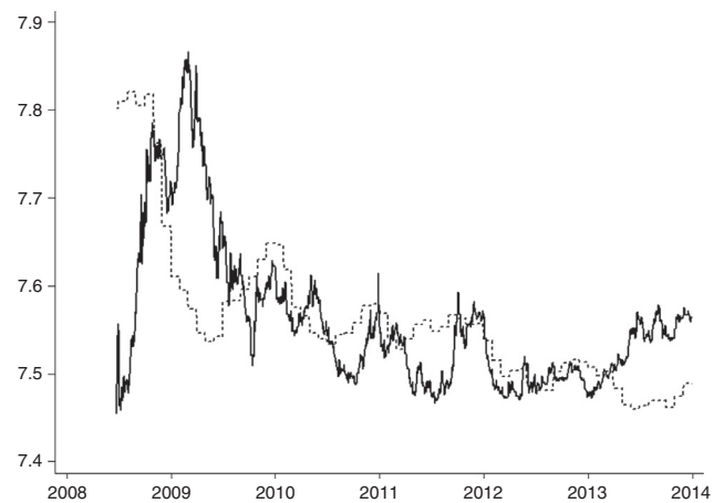
Fig. 1. Spot exchange rates Peso/USD and PPP fundamental levels in logarithms. Notes: The figure depicts time series of the spot exchange rate Colombian Peso/USD (continuous line) and the level consistent with the PPP fundamental (dashed line) in the sample period June 25, 2008 to December 30, 2013.

as the deviation of the exchange rate from its fundamental value ( q_t = 100[\log(S_t) - \log(f_t)] ). Daily levels of the spot exchange rate in logarithms and the fundamental value are depicted in Fig. 1.