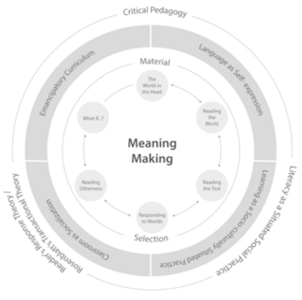
Figure 1. The components of the Book Club with a critical approach.

Three fundamental changes were witnessed during the development of this pedagogical experience. First, there was a move from a strong tendency to focus on grammar and vocabulary when reading texts in English to experience the act of reading as a