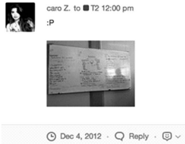
Figure 4. Photo of the Whiteboard Taken by a Student

instance, in the following statement taken from an informal dialog in class: “Teacher, this is better than paper quizzes. I don’t have to wait for my results” (translated from Spanish).