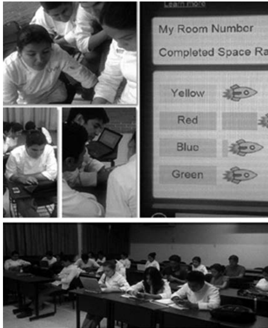
Figure 3. Students Working During Class Activities

Use of tools for practicality and convenience. Another routine adopted by students was taking photos of the notes on the board instead of copying everything into their notebooks. This way of taking notes saved time that could now be devoted to instruction, drilling, and production. Similarly, it became a common practice to ask the teacher-researchers to upload, on Edmodo, the information that had been projected in class, such as PowerPoint and Prezi presentations. For instance, Figure 4 shows that a student uploaded the photo she had taken of the whiteboard in class to share it with all her classmates.