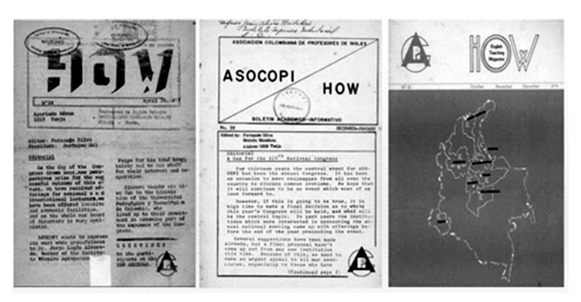
Figure 1. Samples of Covers of First Editions of HOW

From 1977 to 1979, the name of the bulletin was briefly changed to Boletin Académico-Informativo ; however, for Number 33 (corresponding to October-December, 1979) the bulletin was transformed into a journal with the title HOW: English Teaching Magazine . This periodical would survive until 1986 and in 1984, the publication would acquire its ISSN registry, which is the one still in use.