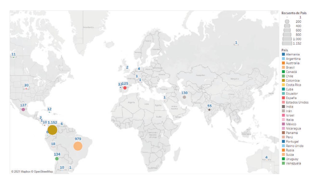
Figure 1. Frequency of the undersigning authors of the articles according to country