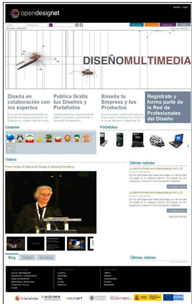
Figure 2. Main page OpenDesignNet interface

The collaborative design workshop area allows a user to create and manage design projects from the platform by using a collaborative on-line work environment to assist users in developing the documentation required during each phase of conceptualising a new product.