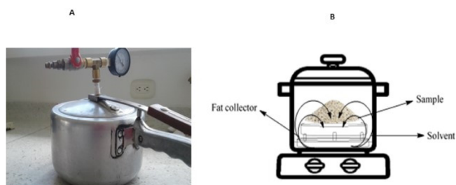
Figure 1. a) Conventional pressure vessel, b) internal pressure vessel system

To optimize the fat extraction process, a central composite 2 2 design with two star points was used. The factors were the type of solvent (A), the extraction time (B), and the amount of solvent (C). The response variable was the percentage of fat recovery, as shown in Table 1, where the levels for each one of the factors, as well as their corresponding units have been included.