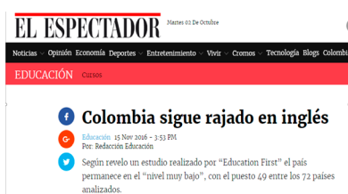
Figure 3 News headline from El Espectador Note: The headline “Colombia sigue rajado en inglés” can be roughly translated to “Colombia still Flunking English” (El Espectador, 2016, November 15).