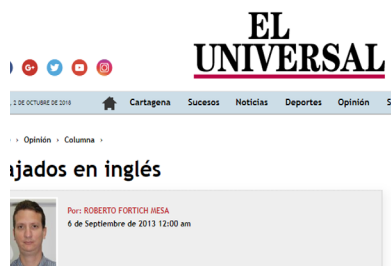
Figure 1 News headline from El Universal Note: The headline “Rajados en inglés” can be roughly translated to “Flunking English” (Fortich Mesa, 2013, September 6).