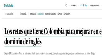
Figure 4 News headline from Portafolio Note: The headline “Los retos que tiene Colombia para mejorar el dominio del inglés” can be roughly translated to “The challenges of Colombia to improve proficiency in English.” The image is a screenshot taken from Portafolio (2017, November 16).

inations or in a ranking of countries by English skills conducted by English First (EF) 2 (see Figures 1 to 4), media reports tended to portray teachers as the primary cause of the supposed or assumed failure.