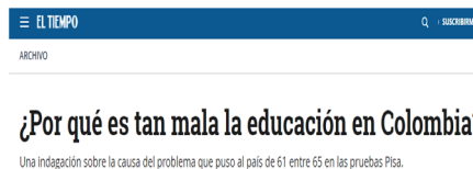
Figure 2 News headline from El Tiempo Note: The headline “Por qué es tan mala la educación en Colombia” can be roughly translated to “Why education is so poor in Colombia” (Gossain, 2014, February 27).