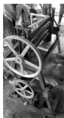
Activity 4: Rolling