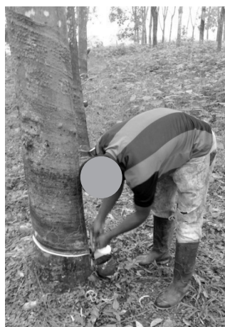
Activity 1: Tapping. In this image the cut is performed near the ground

located on each tree and gather the latex in drums to facilitate their transport to the latex treatment area where next activity is carried out, as shown in Figure 1.