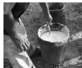
Activity 3: Filtering and dilution of latex