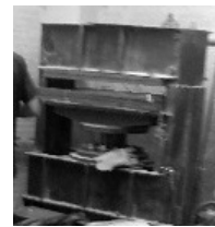
d) Types of molding presses used for compression molding