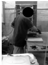
e) Molds handling for compression molding