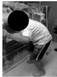
Activity 4: Mill cleaning