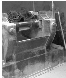
a) Mixing in the open rolls mill