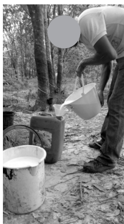
Activity 2: Latex collection in drums