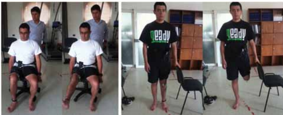
Figure 1. Open and simple kinematic chain (siting and standing)

The Figure 1 depicts an example of two physical tests regarding the sitting and standing position.