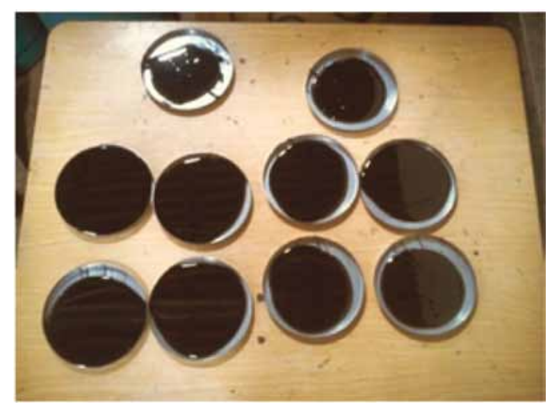
Figure 2. Asphalt trays

• The asphalt is heated to the softening temperature. The 10 stainless steel trays were placed on a balance, adding 50 \pm 0.5 g of asphalt binder to each one. See Figure 2.