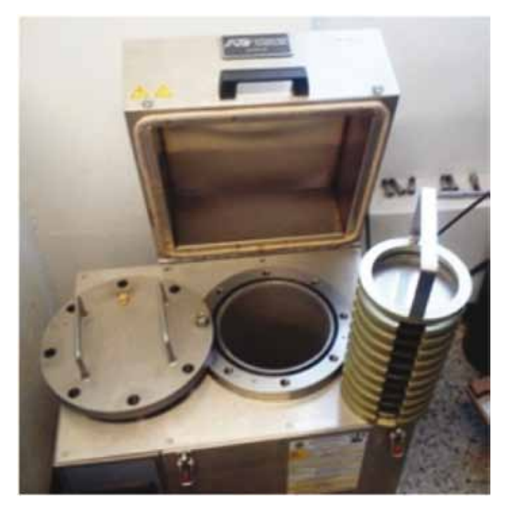
Figure 1. Pressure asphalt vessel and tray holder

• The PAV contains a tray holder in which up to 10 steel trays can be placed. The tray was put inside the pressure chamber. Then, the aging temperature was selected, in this case, it was 100 °C and the pressure chamber was preheated. See Figure 1.