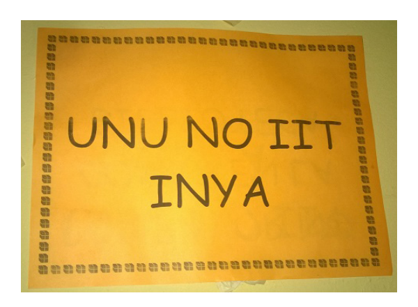
Figure 5. Sign in the library of the First Baptist School, San Andrés, 2015. Angela Bartens.