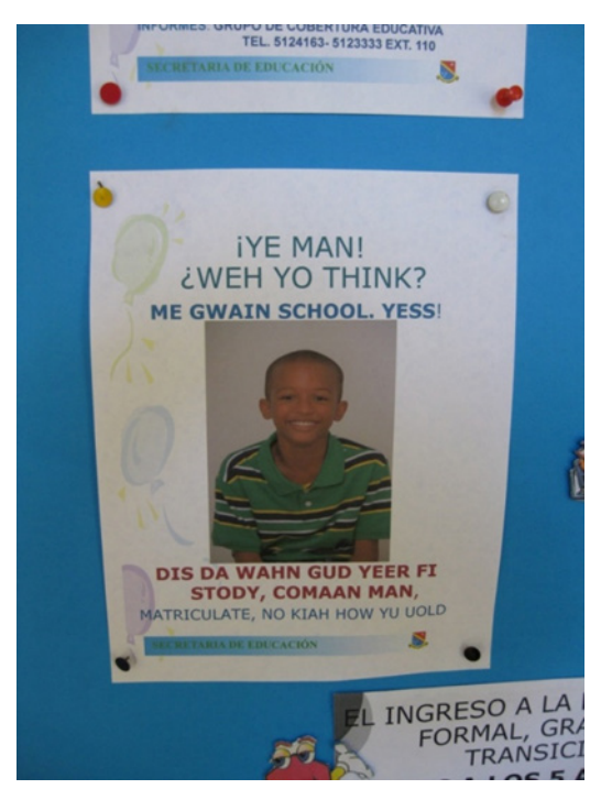
Figure 4. Poster on the notice board of the Secretariat of Education of San Andrés, summoning parents to enroll their children in school, August 2015.