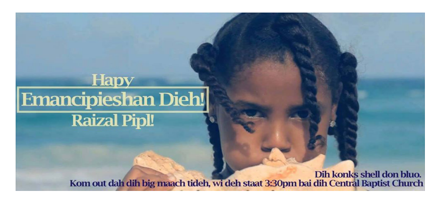
Figure 1. Invitation to the 2016 Emancipation Day March

The Figure 1 reproduces an invitation to the 2016 Emancipation Day March posted on FB, in August 2016. The text reads in English translation: «Happy Emancipation Day! Raizal People! The conch shell has been blown. Come to the big march today, we are starting at 3:30 p.m. at the Central Baptist Church.».