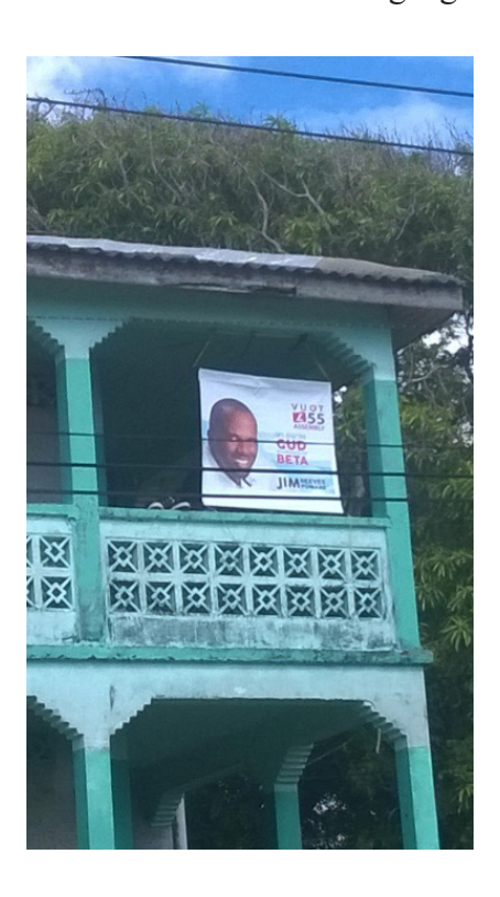
Figure 3. 2015 election campaign poster from rural area in San Andrés in Creole. Angela Bartens.

The Making of Languages and New Literacies: San Andrés-Providence Creole with a View on Jamaican and Haitian tourists— or exclusively where the public is assumed to be mainly Creole-speaking. Given the long tradition of minorization, having San Andrés-Providence CE signs at all, even in a subordinate position —cf. Wang (2018), on Enshi Fangyan signs— as the 2015 election campaign poster in Figure 3 —located off the road and outside the urban center— is eventually leading to coexistence with Spanish as in Figure 4 —a poster in Creole on the notice board of the Secretariat of Education exhorting parents to send their children to school; the poster is among other posters in Spanish with the same content— or exclusive use of Creole as in Figure 5 —a sign forbidding eating inside the library of the First Baptist Church School; it is important to add that a lot of the signage around the school is makeshift—. But the first steps have been taken to claim ownership of not only the language and the culture, but the physical space as well. Whereas the sign in Figure 3 is likely to be directed to Creole-speaking people, the sign in Figure 5 has an educational message for the students of such school whose first language is not only San Andrés-Providence CE, so all similar signs inside of the library of the school —where Creole is promoted most vigorously on San Andrés— are written in that language.