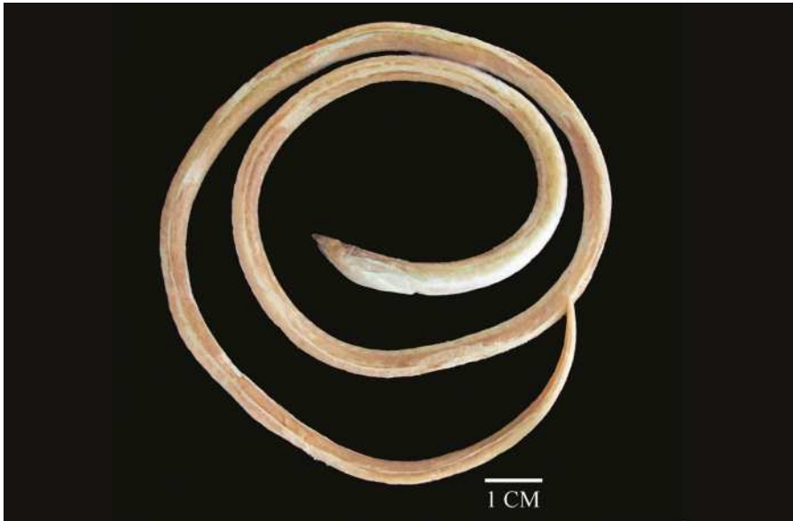
Figure 1. Bascanichthys gaira n.sp., holotype. INV PEC8147, 477 mm TL, Gaira Bay, Santa Marta, Colombia.

Material examined. Holotype, INV PEC8147 (477 mm TL), bahía de Gaira, Santa Marta, Colombia (11°10'11" N, 74°13'14" W), September 5, 2005. Paratypes, INV PEC8145 (468 mm TL) September 5, 2005, INV PEC8146 (411 mm TL) August 22, 2006, all from the same locality as the holotype: Bahía de Gaira, Santa Marta, Colombia (11°10'11" N, 74°13'14" W).